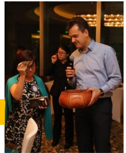
Wingsee donating all her purses content's